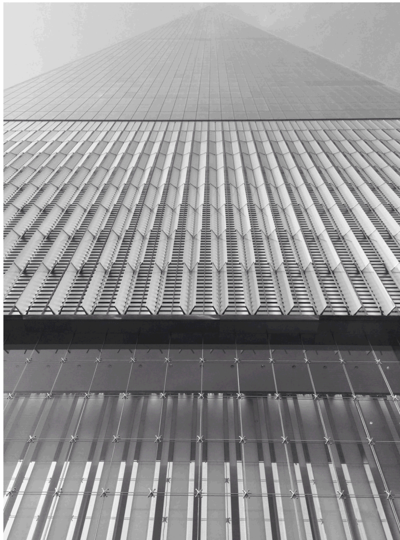
Figure 1: One World Trade Center, New York.

Similar pride is found in other countries' largest cities. Countries often compete to boast the world's tallest buildings, while their people compete for space in such buildings. For example, the temporal satisfaction of having an office at the Empire State Building in New York City elicits a sense of omnipotence, power, and superiority. Figure 1 better exemplifies this idea—imagine having an office suite at the One World Trade Center, the tallest skyscraper in the western hemisphere. This rationale can extend to one's desire to live in cities—isn't it a status symbol to live in Manhattan or in San Francisco?